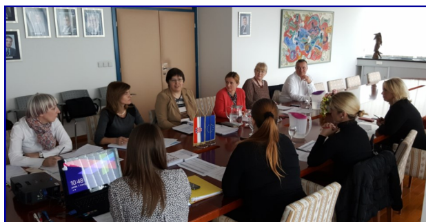
Second coordination meeting of presidents of sectoral councils, April 2016

All the appointed sectoral councils have started with their activities, which include individual work, meetings, coordination meetings of presidents, consultation workshops for project beneficiaries and participation of members in educational events organized by the Ministry of Science, Education and Sports and the Ministry of Labour and Pension System. While the sectoral councils are currently working on their proposals for improvements in the National Classification of Occupations, the aim of the educational events they attend is adequate preparation and training for validation of proposals of occupational standards, qualifications standards and units of learning outcomes. The quality of validation done by sectoral councils is going to have significant influence on the quality of standards which will enter the CROQF Register, which is why their education is of utmost importance.