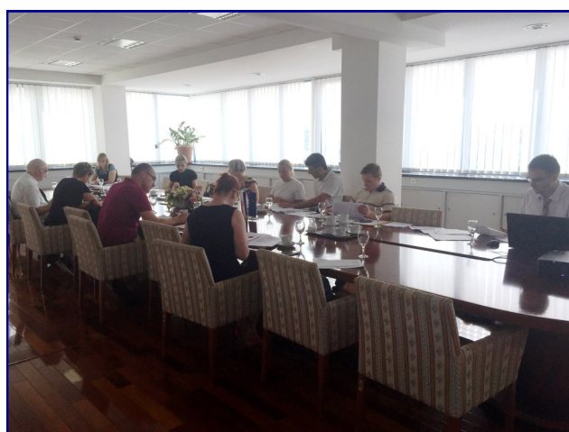
Consultation workshop July 2016

Moreover, project beneficiaries are given guidance and an opportunity to consult with the representatives of the ministries and the members of sectoral councils on how to improve their proposals of standards before officially submitting their requests for entry into the CROQF Register and validation by sectoral councils. The first consultation workshop of that type was held in July 2016 and additional two in September 2016 for project beneficiaries developing proposals of standards in higher and adult education in the sector of Economy and trade, and the same type of guidance will continue being given to other interested project beneficiaries.