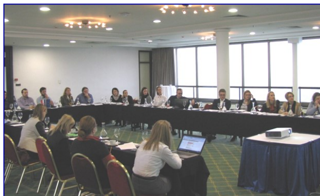
Workshop on the development of occupational standards and qualifications standards, October 2015

In order to support project beneficiaries in the development of proposals of standards, the Ministry of Labour and Pension System has developed Guidelines for development of occupational standards , whereas the Ministry of Science, Education and Sports has developed Guidelines for development of occupational standards . Both methodologies have been presented to project beneficiaries in form of workshops .