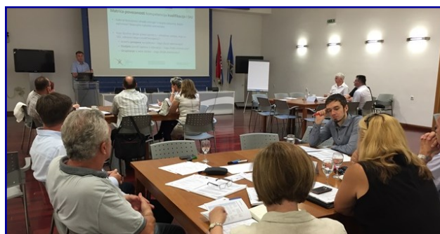
Workshop on validation of units of learning outcomes, July 2016