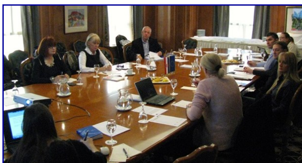
Fourth meeting of Sectoral council XXI Education and sports, December 2015