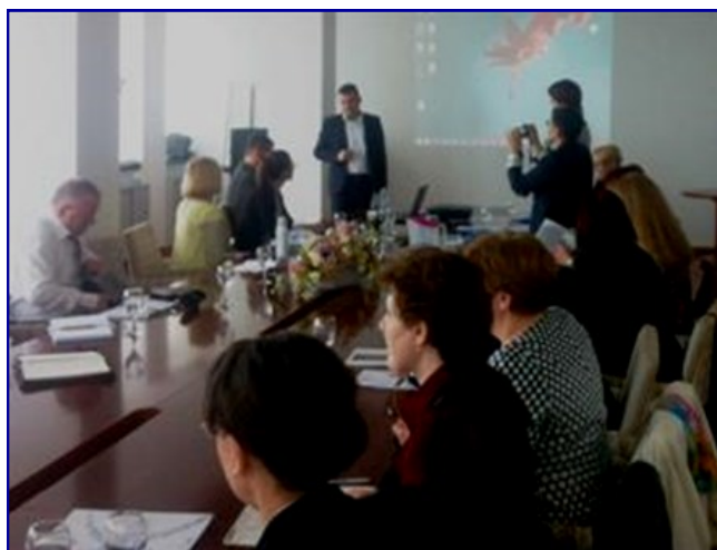
Study visit of the Moldovan delegation, May 2016

In 2015 and 2016 the Ministry hosted delegations from Kosovo, Bulgaria, Macedonia and Moldova. Moreover, in January 2016, representatives of the Ministry visited Bulgaria. Also, in September 2016, representatives of the Ministry visited Moldova within the implementation of the Danube Strategy to present achievements in the development of the CROQF at a workshop on qualifications frameworks and curriculum development in line with labour market needs.