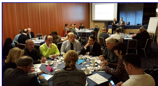
Workshop on validation of standards, March 2016

All the appointed sectoral councils have started with their activities, which include individual work, meetings, coordination meetings of presidents, consultation workshops for project beneficiaries and participation of members in educational events organized by the Ministry of Science, Education and Sports and the Ministry of Labour and Pension System. While the sectoral councils are currently working on their proposals for improvements in the National Classification of Occupations, the aim of the educational events they attend is adequate preparation and training for validation of proposals of occupational standards, qualifications standards and units of learning outcomes. The quality of validation done by sectoral councils is going to have significant influence on the quality of standards which will enter the CROQF Register, which is why their education is of utmost importance.