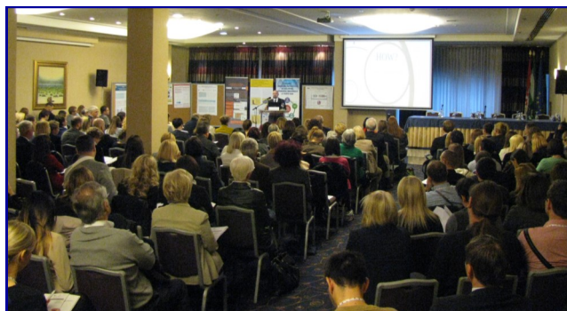
Last years' conference, CROQF: Knowledge and Creativity , October 2015

The National Council works according to annual work plans, and has so far produced various documents and recommendations. Moreover, the National Council has organised several events, such as the conference entitled CROQF: Knowledge and Creativity held in October 2015 and the round table on Skills of the Future for the Development of Croatian Economy held in April 2016.