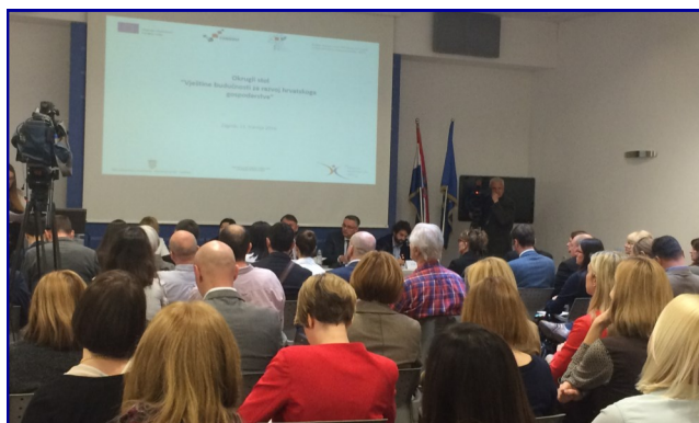
Round table on Skills of the Future for the Development of Croatian Economy , April 2016

Following last years' positive experience and a high number of participants representing various stakeholders, one of the numerous activities planned in 2016 is the conference entitled CROQF Qualifications – for the Market, Society or an Individual? , which is to be held on 27 and 28 October 2016 in Zagreb. The conference will be focused on the potential of vocational and higher education in meeting the current and future needs of the labour market and the contemporary social challenges.