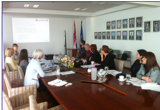
Study visit of the Macedonian delegation, May 2016

As part of the twinning project, the Croatian Ministry of Science, Education and Sports organised a study visit for the representatives of the Macedonian delegation in May 2016. The members of the delegation were given an insight into procedures, tools, bodies and stakeholders involved in the process of development and implementation of the CROQF, with the aim of supporting the development of the Macedonian NQF.