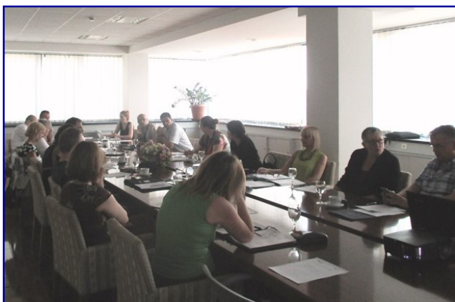
Fifteenth meeting of the National Council for Development of Human Potential, June 2016

According to the CROQF Act, the National Council consists of 25 members , including the President and 24 members nominated by various relevant institutions. The President and members of the National Council were appointed in 2014 by the Croatian Parliament, following the proposal of the Government. By September 2016 the National Council has held 16 regular meetings, as well as numerous meetings of the five smaller thematic working groups formed within the National Council, focused on different aspects of the National Council's work: